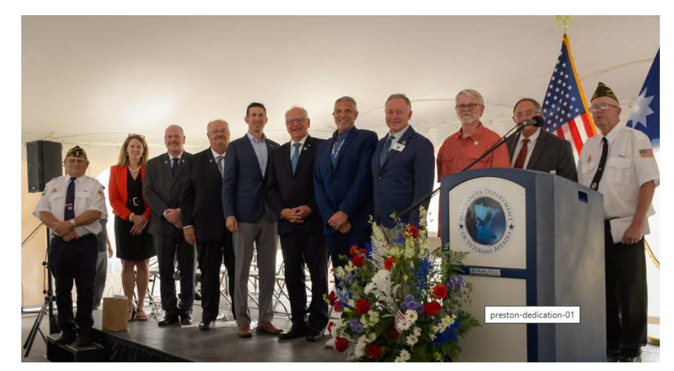
Preston Veteran Home Dedication Ceremony June 2024