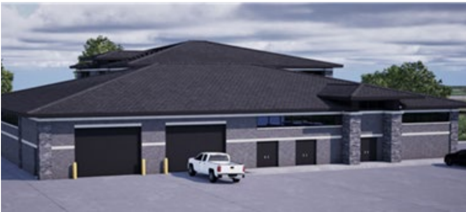
Water Treatment Plant Proposed Design

To best serve the community, the City needs to build a Water Treatment Plant.