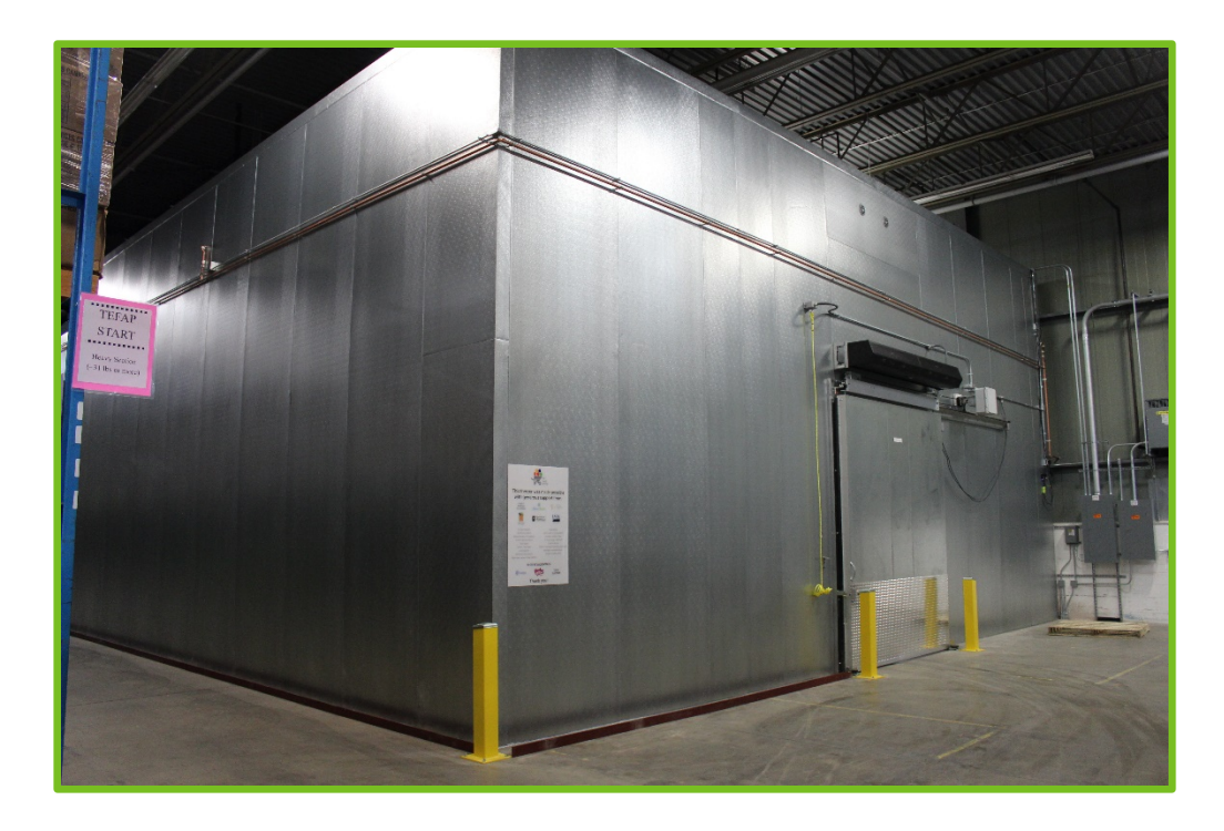
Figure 1. The Food Group, based in New Hope, used a FY2019 GFAP Equipment and Physical Improvement Grant to install a racking system in a new freezer. The increased freezer capacity has made it more possible for their Fare For All program to include locally produced and culturally specific products, such as vegetarian wild rice burgers and locally raised ground beef, in their retail food shares.

Of the 25 retailers who benefited from GFAP grants, 22 retailers directly participated in SNAP during FY 2019 and had total SNAP redemptions of $8,235,890 in FY 2019. The remaining retailers participated in SNAP via an authorized farmers market and redemption information is not available for them. In FY 2019, 12 retailers participated in WIC and had total sales of $382,808.