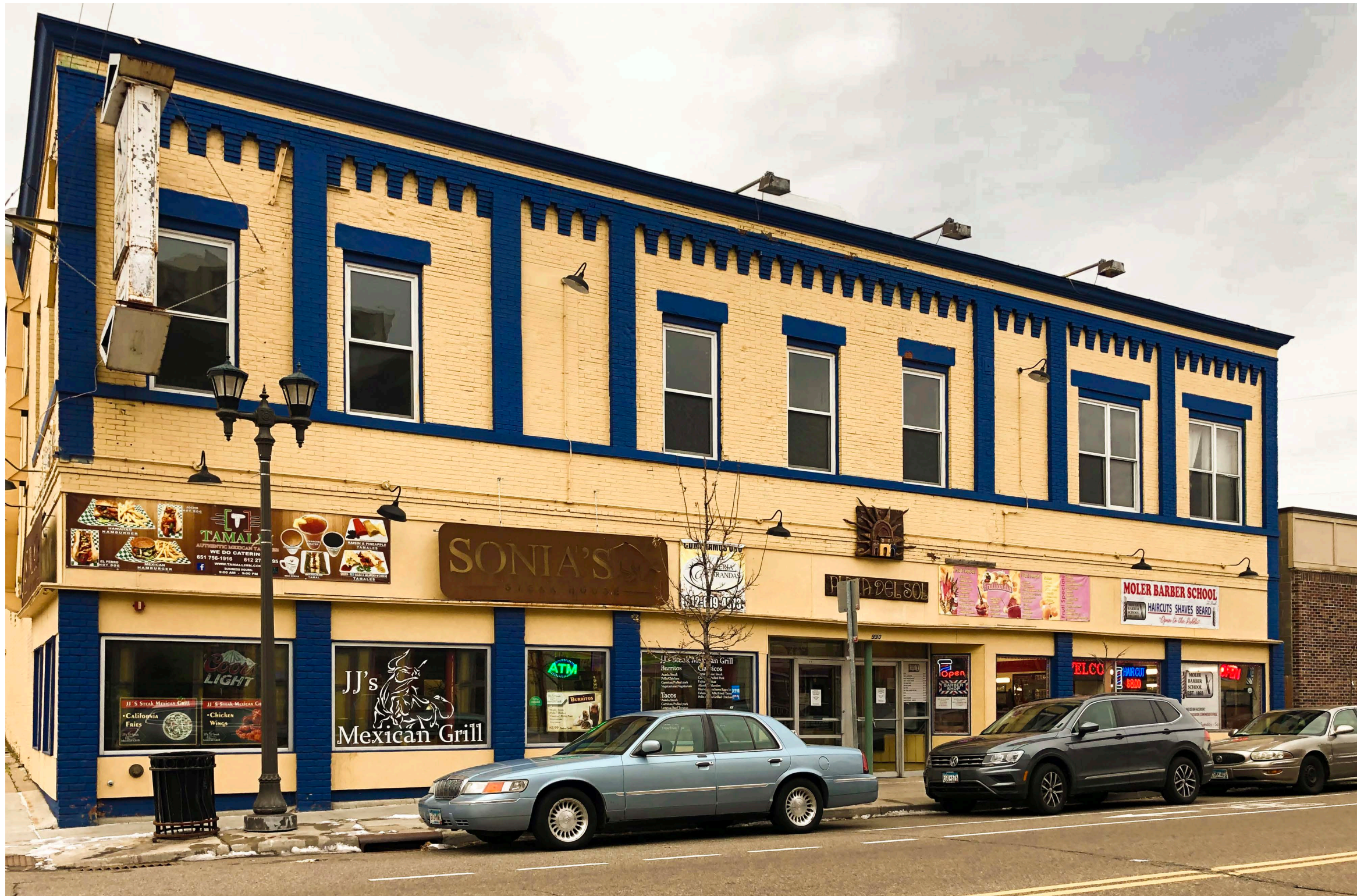
A HISTORIC BUILDING