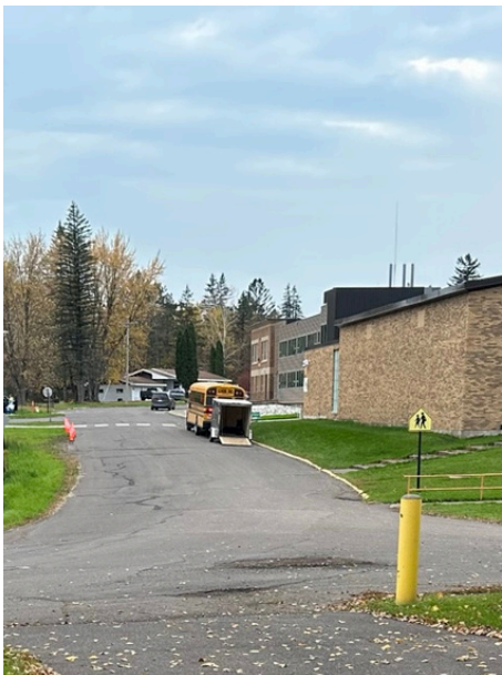
Current Conditions of Pioneer Drive

The City of Wrenshall is looking to do water utility and street improvements to Pioneer Drive, which is the main entrance to their school district. This includes fire suppression utilities that will provide emergency services with water utilities on the south side of the school. The pavement and sidewalks are in poor shape and not up to current ADA standards. Similarly, the city's sanitary sewer in this section is in extremely poor condition with misaligned joints and visible sources of infiltration. The city has had to undergo frequent jetting to ensure no clogging in the system, which is quite costly and a constant health and sanitary issue for the pedestrians, residents, and students in the area.