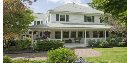
Today's Medical and Mental Health Clinic

Magnus is a 501(C)(3) charitable organization that opened in 2021. Since then, membership has more than doubled every year (we're now at 1,011 members), a sure sign that existing governmental and community resources are not meeting the real needs of veterans across the entire State. Our growth requires remodeling and improvements to our existing campus.