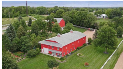
Current Human Performance Center