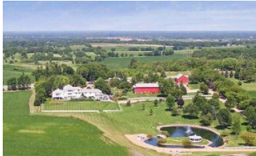
Magnus' 34-acre campus