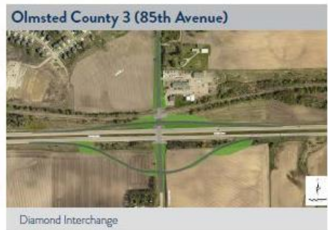
Conceptual alternatives subject to change.