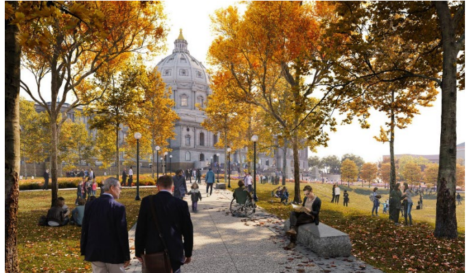
Human scale image of the Mall upon completion of the CMDf

The Capitol Mall Design Framework (CMDf) is a long-term vision for the future of Saint Paul's Capitol Mall led by the Capitol Area Architectural and Planning Board (CAAPB). It is the result of a planning process completed in 2024, which engaged community partners, government agencies, and Minnesotans from across the state to reimagine a Mall that suits their needs. It follows and reinforces the broader planning recommendations of the 2040 Comprehensive Plan for the Minnesota State Capitol Area.