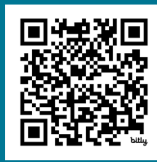
Video: Experience driving this route

Encouraging community connection, preventing pollution and promoting climate resiliency