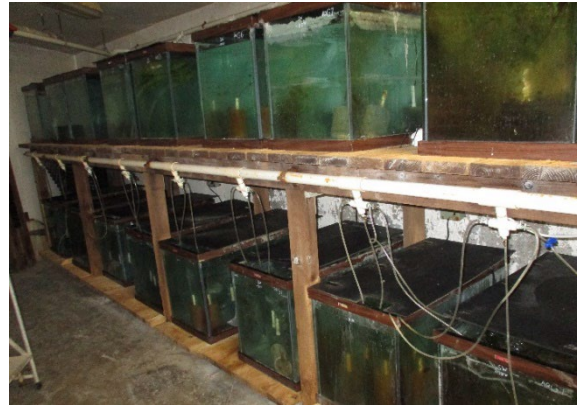
Deteriorating Aquatic Life Support System