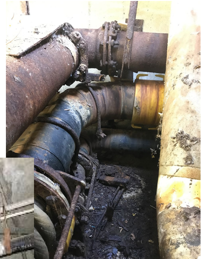
Rusted Mechanical Piping