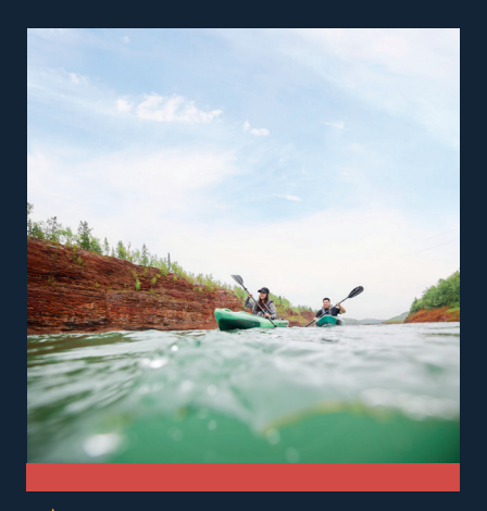
* 80.2 million total visitors*

Sources: *Longwoods 2023; Tourism Economics 2023