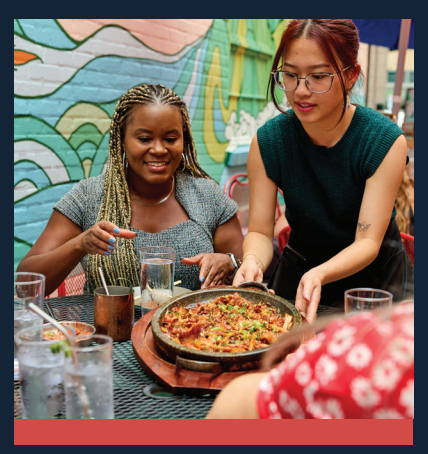
* 180,473 jobs generated