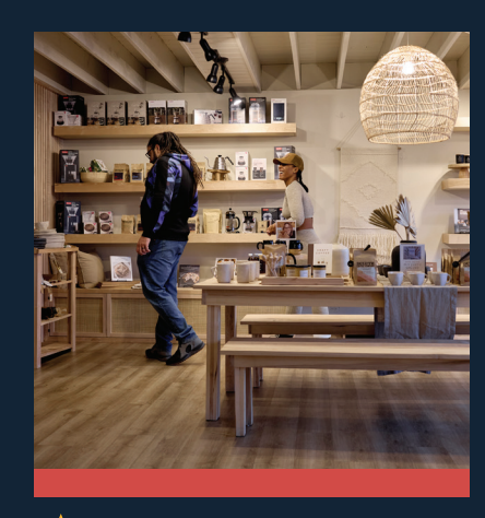
* $14.1 billion visitor spend