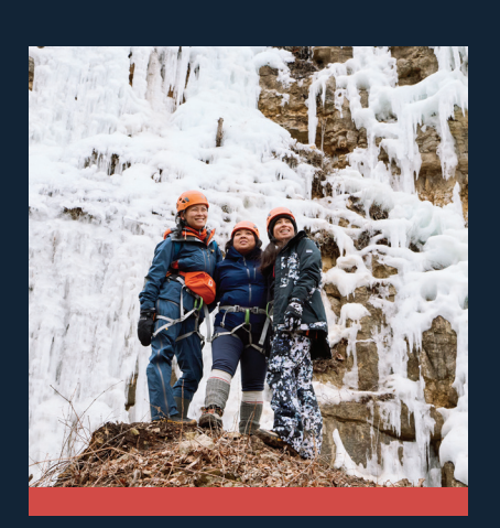
$2.3 billion state and local taxes generated