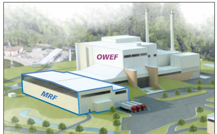
Rendering of proposed MRF

Other benefits of a regional MRF include: