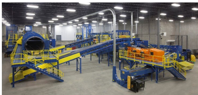
Photo inside Perham MRF

Increased revenue from the sale of recyclable materials will be part of the solid waste management public "Enterprise Fund." Olmsted County is unique in that its integrated solid waste management system is funded primarily by user fees, the sale of energy, and the sale of recyclable materials. No property tax dollars are used, nor are they planned to be used in the future.