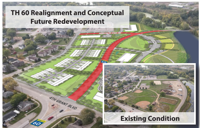
TH 60 Realignment and Conceptual Future Redevelopment