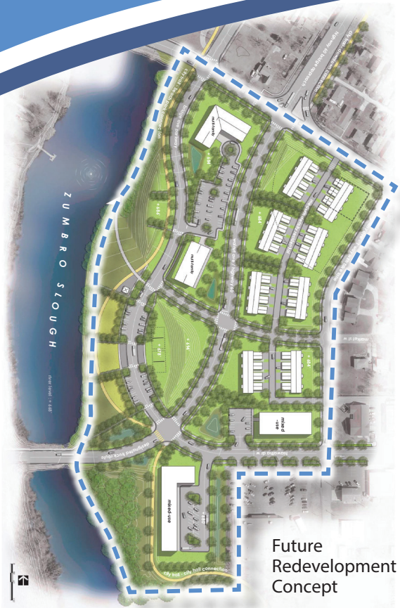
Future Redevelopment Concept

The site surrounding the TH 60 realignment as proposed will create new public infrastructure incentivizing needed residential and commercial development and flood resilience. A 2023 housing study initiated by the City of Wabasha determined both community and regional need for new construction of varied housing types to meet current and future workforce demand. Southeast Minnesota is jobs-rich, but growth is limited by housing. This project is well-planned transportation infrastructure that bolsters both housing and commercial development, access to natural resources, and improved flood resilience at the terminus of 1 of 6 of Minnesota's interstate Mississippi River freight and vehicle bridge crossings.