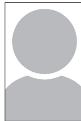
Republican Speaker-designate TBD